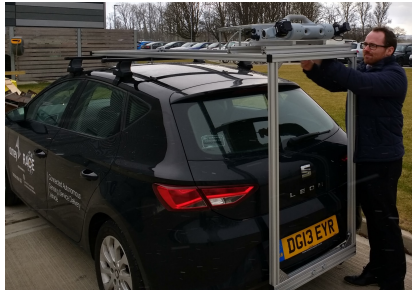
Figure 2: NABU unit mounted on test vehicle