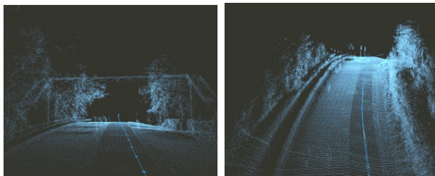
Figure 3: NABU generated point cloud maps showing a footbridge and a set of traffic signals

The point cloud maps generated are internally consistent with a high degree of accuracy. However, in its current configuration the NABU does not integrate GPS tags in the point cloud maps, but parallel GPS data sets were collected, and this was used to provide basic geolocation validation.