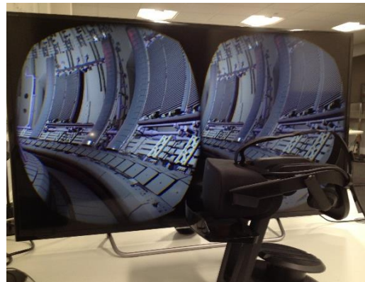
Figure 1: Synthetic Viewing of JET

A synthetic vision system (SVS) is a computer-mediated reality system for remote operation, that uses 3D to provide operators with clear and intuitive means of understanding their remote environment. For the operators of the JET remote handling system, operators utilise synthetic views created by a virtual reality system, which is constantly updated in real-time with position data relating to the robotic systems. This supplements a comprehensive, low-latency CCTV viewing system.