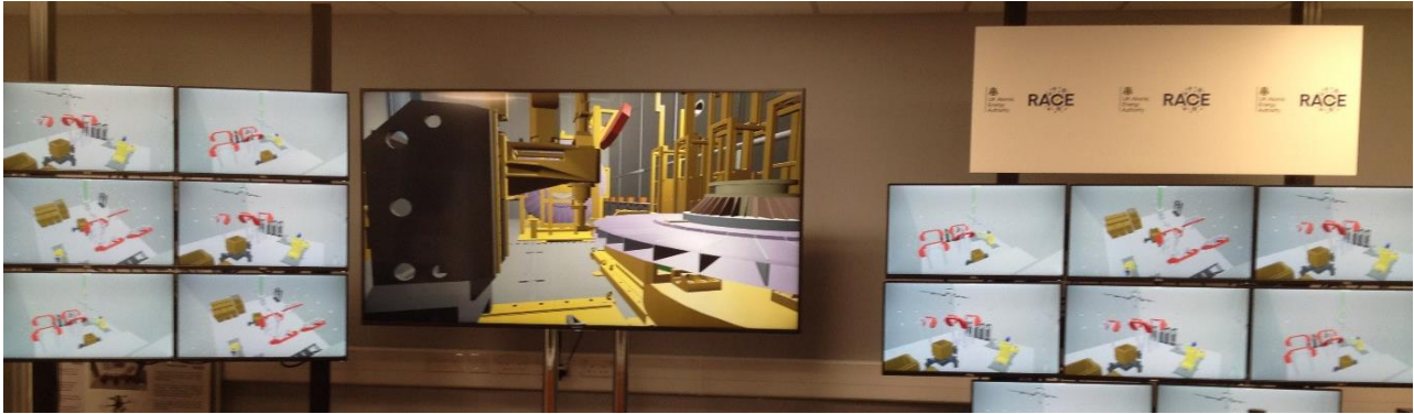
Figure 2: Control room of a simulated ESS windowless hot cell.

The ESS ACF contains an environment similar to JET, but with additional constraints due to the higher radiation doses that will be present. For a windowless hot-cell with limited sensors that are prone to failure, a synthetic viewing system will be critical. The system will provide an outlook to the probable state of the hot cell, allowing for more effective operations to be performed. For example, the elbows of a tele-manipulator can be monitored in three dimensions (with no camera views) for possible collision.