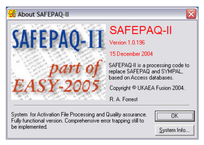
Figure 4. The About SAFEPAQ-II window.